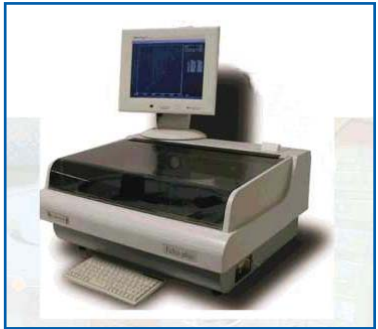
EASYCHEM Discrete Analyzer