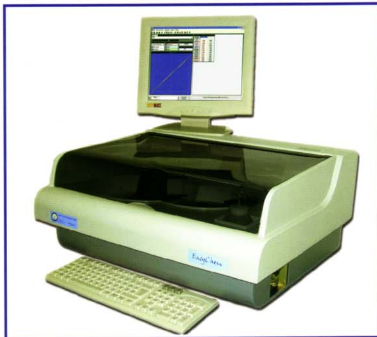
EasyChem Discrete Analyzer