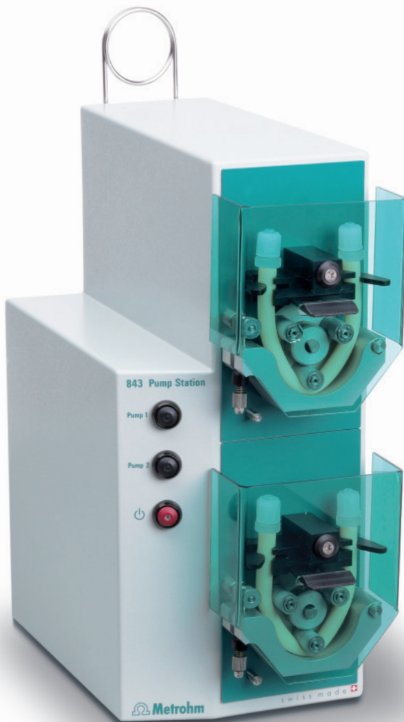
843 Pump Station (peristaltic)