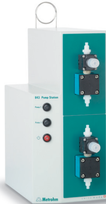
843 Pump Station (membran)