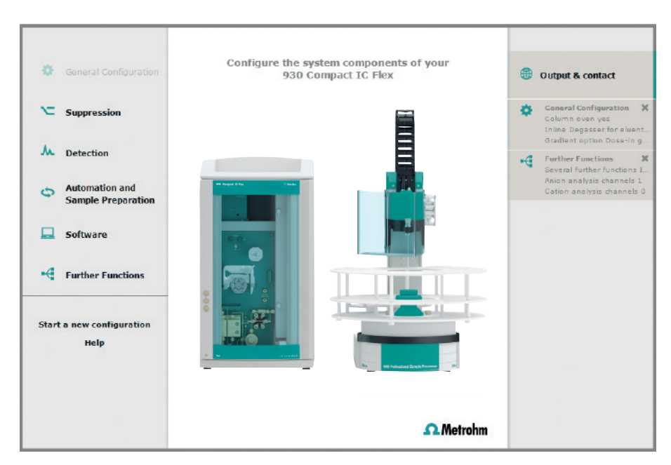
The new 930 Compact IC Flex configurator allows you to put together your customized IC system for routine analysis in just a few steps. Combine up to 90 different instruments and accessory parts depending on the requirements of your application. Try it out on ic930.metrohm.com

Your way to your customized 930 Compact IC Flex system is simple: Use our new online configurator (ic930.metrohm.com) to select from a wide range of options and put together precisely the right system to meet your requirements. With the new 930 Compact IC Flex the dream of a customized high precision tool for routine analysis has at last come true!