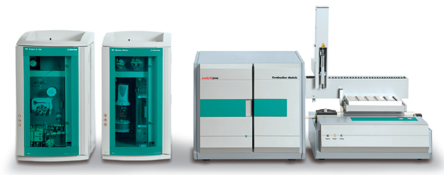
The 930 Compact IC Flex can be used to analyze gaseous, liquid, and solid samples. The Combustion IC system shown can be used for differentiated determination of the halogens and sulfur in combustible samples, e.g. plastics, raw or end products in the petroleum industry, samples from waste management or electronic components.

Furthermore, low detection limits also make the instruments in the 930 Compact IC Flex family an excellent choice for routine analysis in power plants with detection limits down to trace levels. And finally, the new compact ion chromatographs from Metrohm are not only suitable for routine analysis in the petrochemical industry but also for the quality monitoring of alternative fuels, e.g. bioethanol and biodiesel.