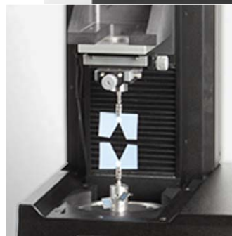
T150 Universal Testing Machine