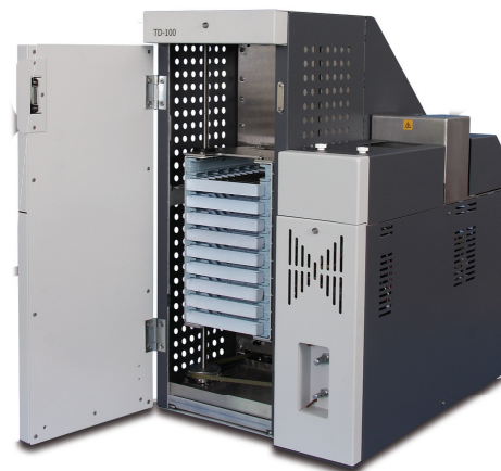
TD-100: 10 trays, each accommodating up to 10 capped tubes and incorporating "50:50" capability for automatic sample re-collection (SecureTD-Q)