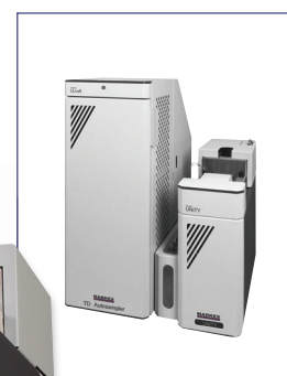
Series 2 ULTRA-UNITY-Air Server